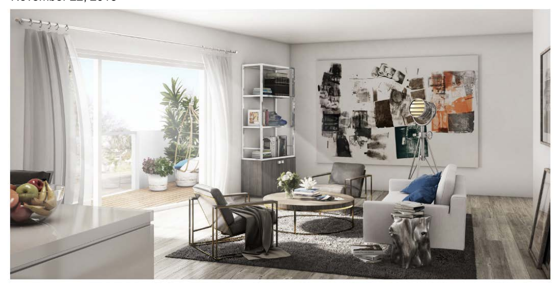
Featuring architecture by award-winning JFAK Architects...

<u>AIRE Santa Monica</u> is boutique collection of 19 residences showcasing gallery-like interiors in the charming coastal city of Santa Monica. Large glass sliders, double-height ceilings and clerestory windows add dimension and welcome in the coastal light and favorable California climate. Open-concept floor plans incorporate sophisticated chef-caliber Viking Professional kitchens, German-made Leicht cabinetry and wide-plank French white oak flooring. The result is quintessential Santa Monica design and a fresh canvas for the modern lifestyle.